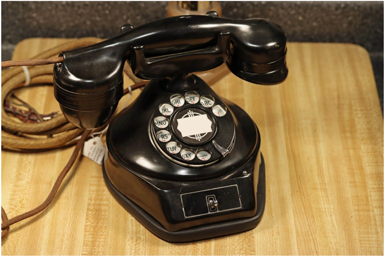
Automatic Electric 2-Line, Model AA-24 Single Key, Multiline Monophone Cradle Telephone

Description from Automatic Electric Catalog 4055-D (7-44), page 14: