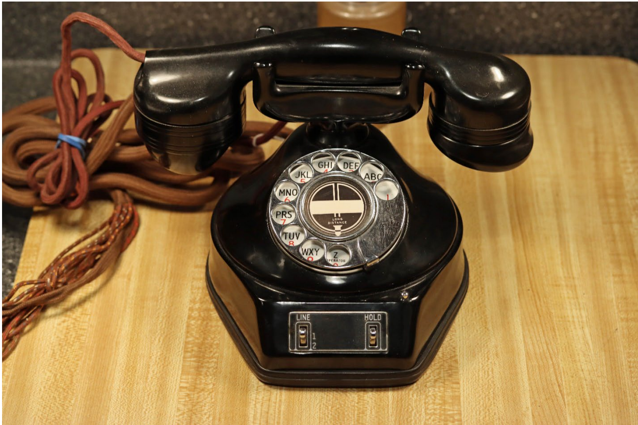
Automatic Electric AA-44 2-key, 2-line Monophone Cradle Telephone

Description from Automatic Electric Catalog 4055-D (7-44) Page 15: