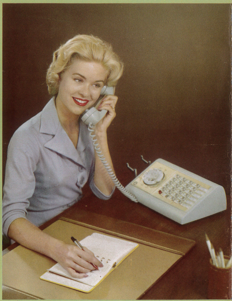
FOR THE SECRETARY OR CLERK who provides centralized telephone answering for a number of people.

THE CALL DIRECTOR is suitable for use in any business operation: purchasing—warehousing—production—advertising—accounting—sales —traffic—customer service—administration—personnel.