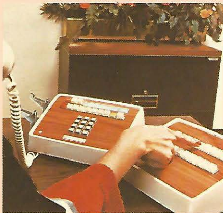
Direct Station Selection Consoles

Desk or Wall Telephones - 11 and 13 button Com Key 718 telephones are available in Touch-Tone® and dial versions.