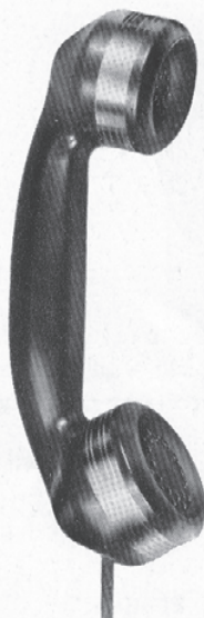
Type 41 Handset (Furnished Complete with Cord).

The Type 41 Monophone Handset is used in Types 40, 50, and 34A3B Monophones, shown in this catalog. It is modern in appearance, light in weight and well-balanced for easy use, and is equipped with the newest type of "capsule" transmitter and receiver, providing high transmission volume and fidelity over the entire range of ordinary operating conditions. The handset is molded of plastic, with receiver wires molded directly into the handle.