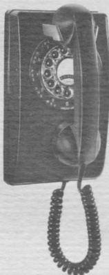
Wall Mounting TD-4510