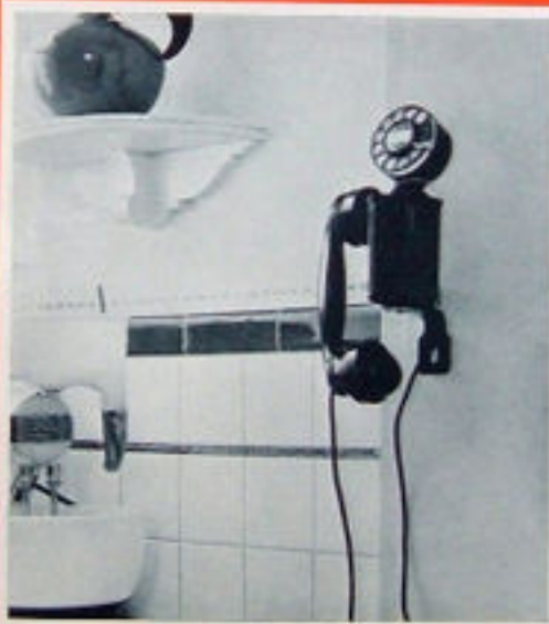
KITCHEN. Always at hand for ordering household supplies. Offers a wide range of usefulness in that big job of running a home.