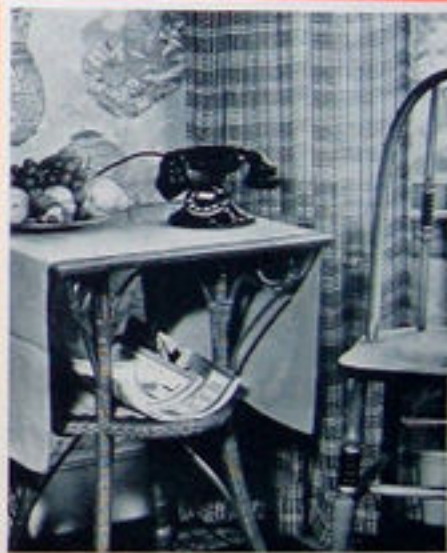
SUN ROOM OR RECREATION ROOM. A portable telephone to assure that hour of relaxation.