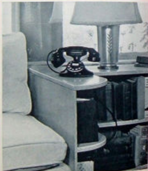
STUDY OR LIBRARY. Privacy for the occasional business call. Saves time when you are doing some evening work.