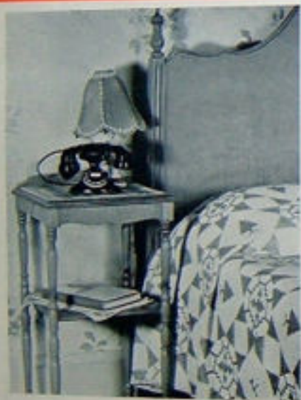
BESIDE YOUR BED. Brings a feeling of security at night. At arm's reach, ready to call a physician, the fire department, or the police. A step saver when working or reading upstairs.

Your family and house may require only one telephone—or a dozen. Illustrated here are the five locations which experience has shown to be most popular and important. Consider them in relation to your house and family needs. Other locations worth consideration are guest rooms, summer house, servants' quarters, shop, garage and laundry. Some locations are adequately served if equipped with an outlet so that a portable telephone may be plugged in when needed.