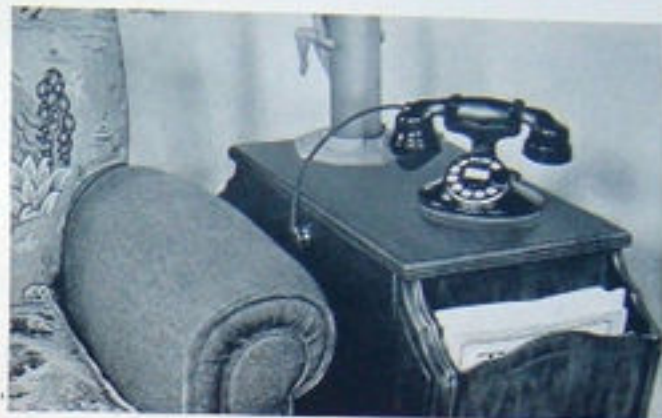
LIVING ROOM. Beside the easy chair where you spend your evenings, an extension telephone means that you can converse in perfect comfort.