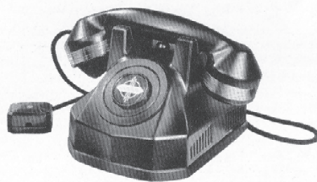
Type 34A3B Monophone—Man., Conv. Cat. Nos. AA-67 and AA-68

The modernization of the Type 34A3 Monophone has been completed by the use of the new and exceptionally compact Type 11 and 12 Connecting Blocks used with the Type 40 Monophone, and black cords, instead of the brown cords formerly used. In most other respects, Type 34A3B is identical with the Type 34A3 Monophone. The circuit is the famous anti-side-tone circuit which has been standard in central-battery Monophones for many years. For operating organizations which have standardized on this circuit, and wish