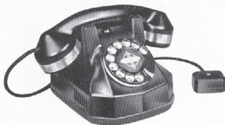
Type 34A3B Monophone—Automatic Cat. Nos. AA-65 and AA-66

Because of its popularity with both the operating man and the telephone subscriber, many companies in recent years have standardized on the Type 34A3 Monophone for all installations where a self-contained desk-type instrument can be used. For such companies, we now offer a new instrument combining the basic design features of the Type 34A3 Monophone with the improvements provided in the new Type 41 Monophone handset. The base of the Type 34A3B Monophone is identical with that of the Type 34A3, except that the base molding is especially shaped to accommodate the Type 41 handset. Thus, the telephone company retains the advantages of standardization in circuit and in most of the major components; the use of the new handset results, however, in marked improvement in transmission quality and volume, and provides better comfort and "feel" in use.