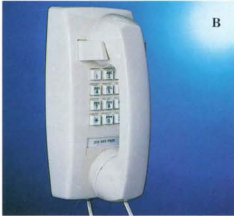
The 2500 Model Touch-Tone Wall Telephone. Always within easy reach.

#3100-1TDB (Black) .....$55.00 #3100-1TDI (Ivory) .....$55.00 AT&T Installation (optional) .....$12.00