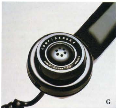
G Confidencer installs in seconds.

#3120-02WB (Black) .....$340.00 #3120-02WI (Ivory) .....$340.00