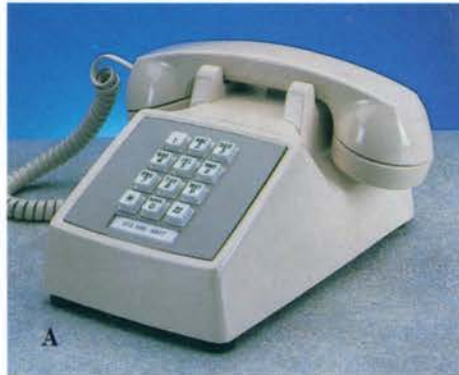
AT&T 2500 Model Single Line phones: call them affordable, reliable.

The 2500 and 500 Model analog phones offered on these pages are compatible with AT&T Communications Systems: MERLIN System, MERLIN Plus System, MERLIN II System, System 25, 75, 85, and DIMENSION with the exception of the SPIRIT Communications System. For a quick reference to Voice Terminals offered in this catalog, see our Voice Terminal Compatibility Matrix, page 3. See the Small System Comparison Guide, page 29, to note your System's specific capabilities: line capacity, station capacity, more.