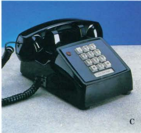
The Touch-Tone Desk phone with Message Waiting Light: a hotel/motel favorite, with good reason.

#3100-TWRB (Black) .....$60.00 #3100-TWRI (Ivory) .....$60.00 AT&T Installation (optional) .....$12.00