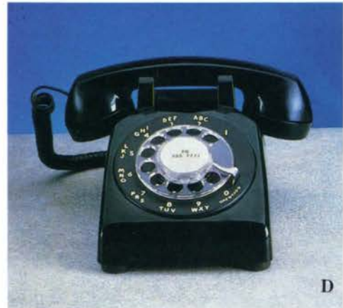
Our high quality standard rotary desk set.

#3100-2TDB (Black) .....$75.00 #3100-2TDI (Ivory) .....$75.00 AT&T Installation (optional) .....$12.00