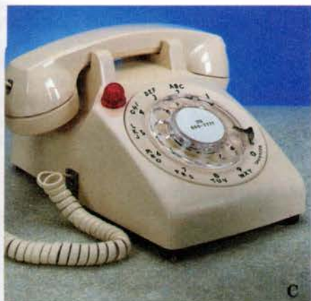
The AT&T Rotary Desk Phone with Message Waiting Lamp: getting the message through.