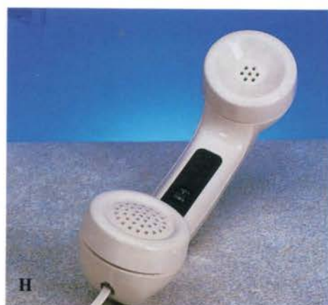
H Our amplified handset, invaluable in a noisy area.

#31051A + B (Black) .....$37.00 #31051A + I (Ivory) .....$37.00