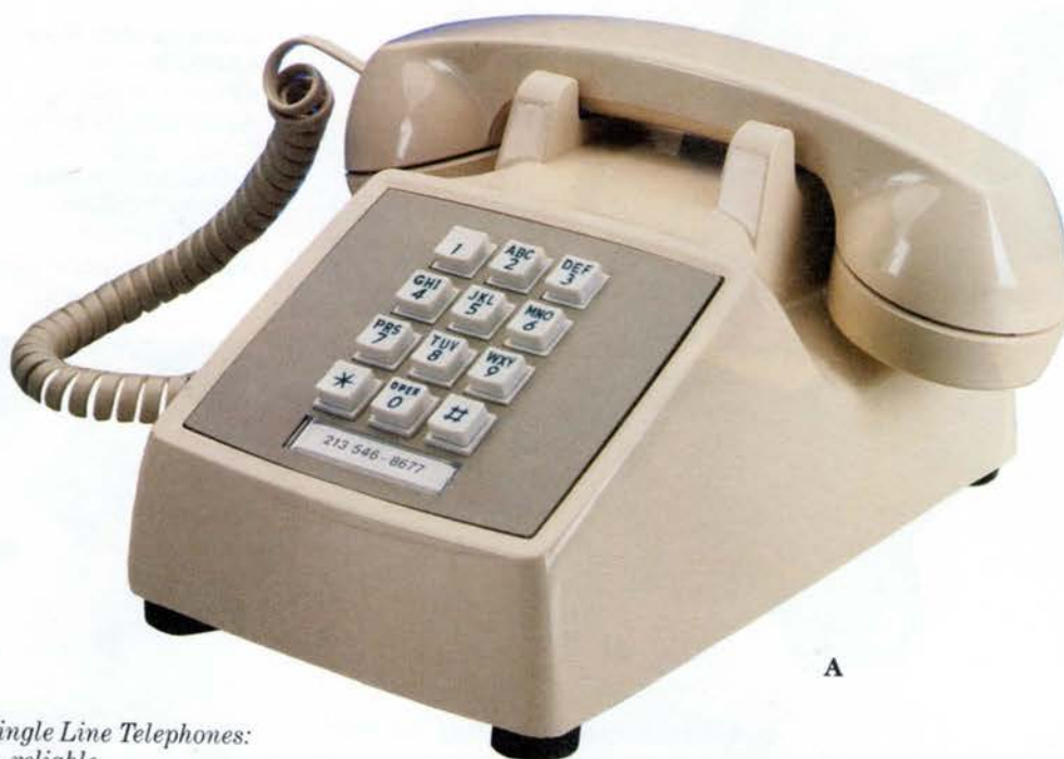
AT&T 2500 Model Single Line Telephones: call them affordable, reliable.