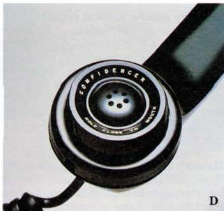
Confidencer installs in seconds.

#31050A + B (Black) ..... $37.00 #31050A + I (Ivory) ..... $37.00