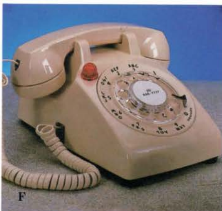
F The AT&T Rotary Desk Phone with Message Waiting Lamp: getting the message through.

#3100-2RDB (Black) .....$65.00 #3100-2RDI (Ivory) .....$65.00 AT&T Installation (optional) .....$12.00