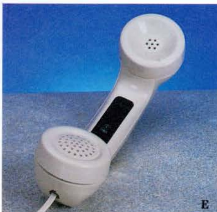
Our amplified Handset, invaluable in a noisy area.

#31011A + B (Black) ..... $40.00 #31011A + I (Ivory) ..... $40.00