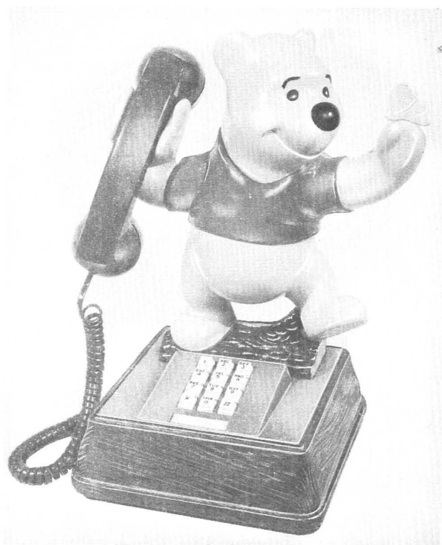
Fig. 1—CS2881CG113 DESIGN LINE Decorator Telephone

1.01 This section contains information on the CS2881CG113 (Fig. 1) DESIGN LINE* decorator telephone (WINNIE-THE-POOH Phone†).