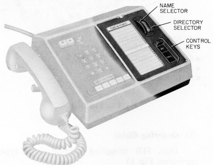
Fig. 3 — 51B Dial Controls