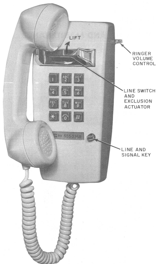
Fig. 2—2551A Telephone Set, Handset in Rest Position