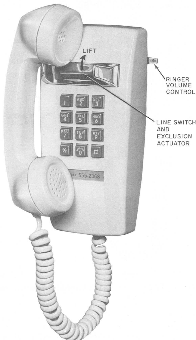
Fig. 1—2550A Telephone Set, Handset in Rest Position