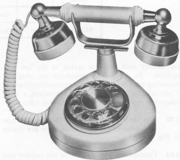
Fig. 1—940-Type DESIGN LINE Telephone Set†

2.01 The 940A, 940B, and 940C rotary dial equipped telephone sets are new DESIGN LINE telephone sets being made available to the customer. The customer buys the housing, handset, and decorative features from the telephone company and the telephone company retains ownership of the transmission and signaling components which are mounted on a removable base (Fig. 2) and incorporated in the handset.