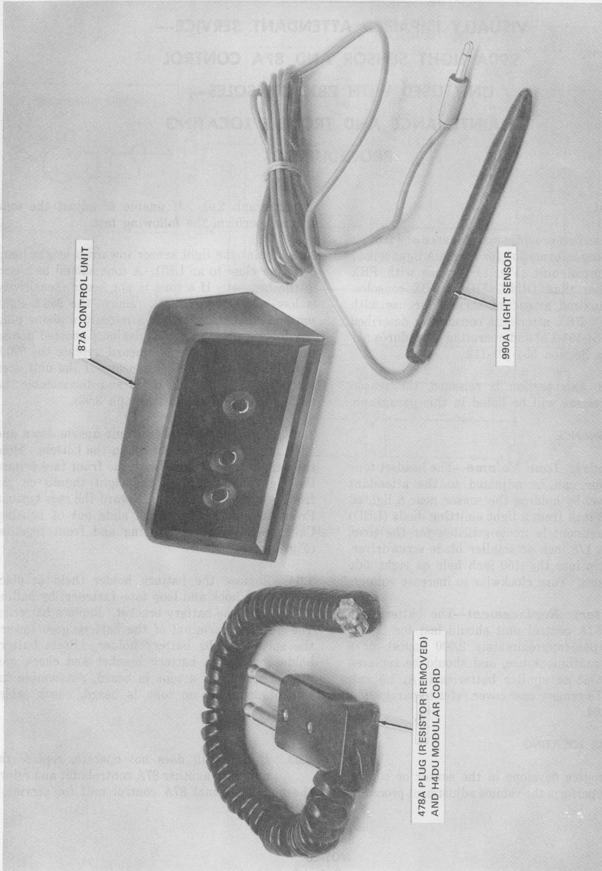
Fig. 1—Control Unit, Light Sensor, and Cord Assembly