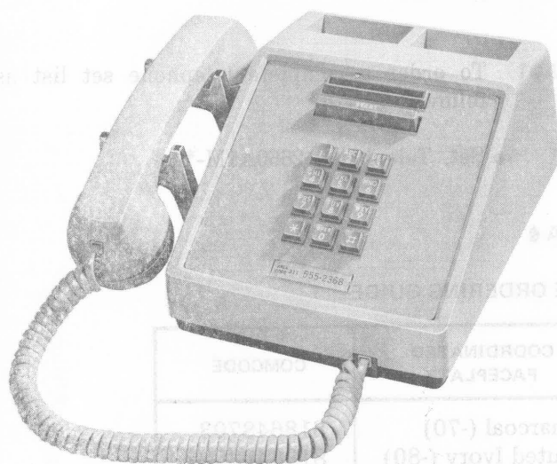
Fig. 1—2660A1M Telephone Set

2.07 M1B ringer volume is adjustable by use of the volume control (accessible from the bottom of the set). Ringer cut off can be provided by removal of the volume control stop screw through an access hole in the base of the set. If tip party identification is required, a M1A ringer must be ordered and installed separately.