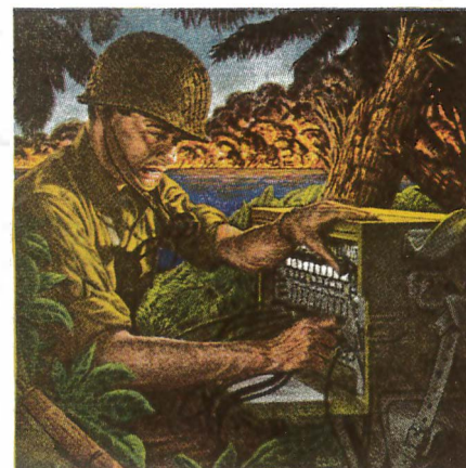
THE INFANTRY uses great quantities of portable switchboards, field telephones and wire to link foxholes, command posts and headquarters.