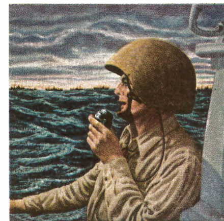
THIS COAST GUARDSMAN, standing watch, telephones warnings to the bridge to help keep the convoy's many ships in protected formation.