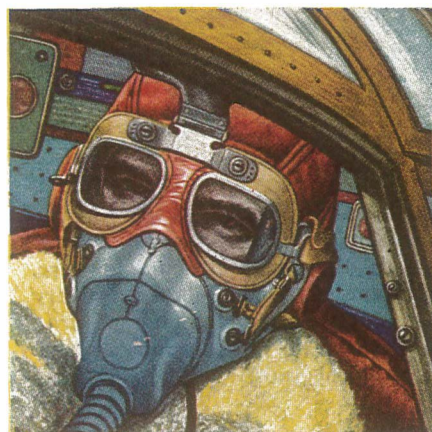
ARMY AIR FORCES planes by the hundreds fly and fight as one team because of their radio telephone — and interphone equipment.