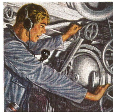
ON OUR SUBMARINES, sound powered telephones, operating on current generated by the speaker's voice, connect all battle stations.