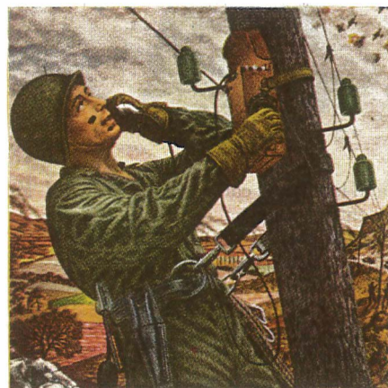
THE SIGNAL CORPS provides the circuits for Victory—thousands upon thousands of miles of telephone wires needed to coordinate the attack.