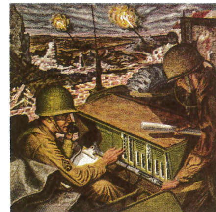
FIELD ARTILLERY "Long Toms," blasting unseen targets, are directed by voices flashing through multi-channel radio telephone sets.

Y OU best know your telephone as a friendly instrument of peace. Our fighting men know it as an effective weapon of war.