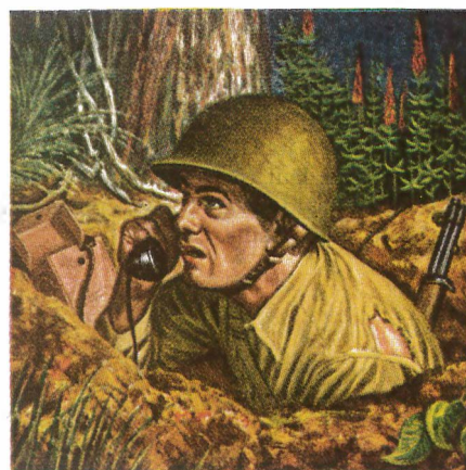
THE MARINE CORPS, storming ashore into almost impassable jungles, depends upon field telephones to deliver orders and reports instantly.