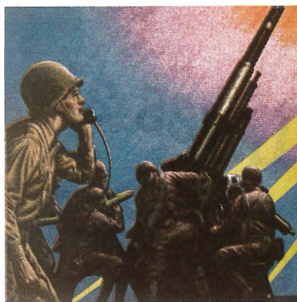
ANTI-AIRCRAFT ARTILLERY fire is coordinated and controlled by field telephone—the brother of your familiar Bell System telephone.

It's an old friend of yours — and it is used by every branch of the Armed Services !