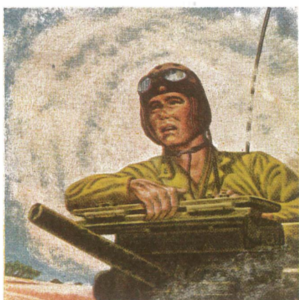
THE ARMORED FORCES use radio telephone to inter-connect tanks, scout cars, command cars, artillery units and anti-tank vehicles.