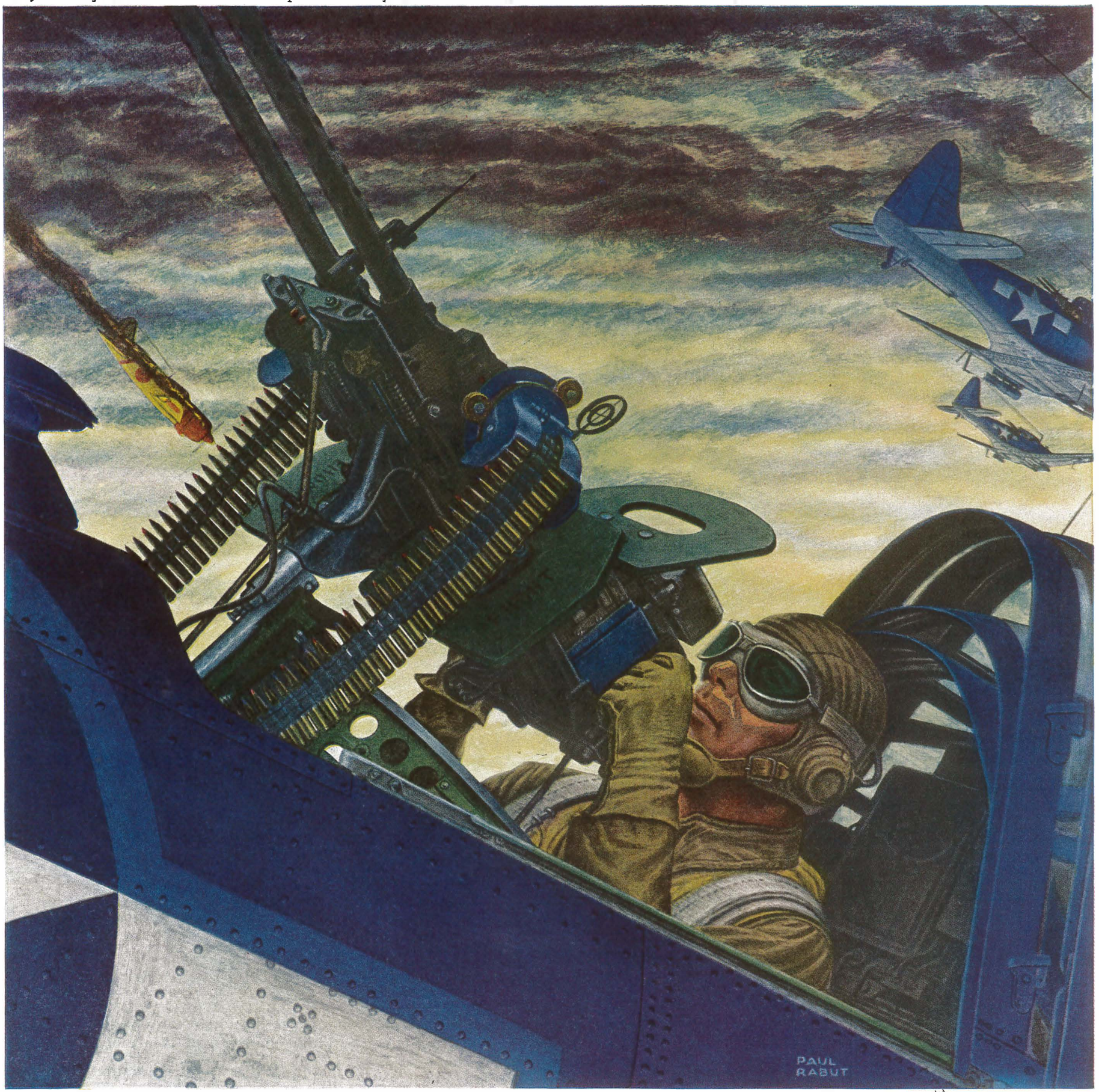
Every branch of the Armed Services uses the telephone. No. 13 of a series, Naval Aviation

Navy dive bombers—about to strike! In each rear cockpit rides a radio gunner -trusted protector of his pilot and plane. His skill with radio and detection devices permits his pilot to concentrate on flying the plane and blasting the objective. His marksmanship makes enemy planes scarcer, brings V-Day nearer.