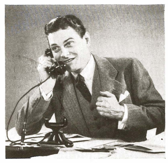
"Oh, boy! It works as well as ever."

Rigid "built-to-take-it" standards and quality-producing craftsmanship are Western Electric's contribution to better telephone service for you.