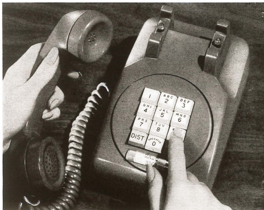
▲ A phone that has push buttons instead of a dial for calling.