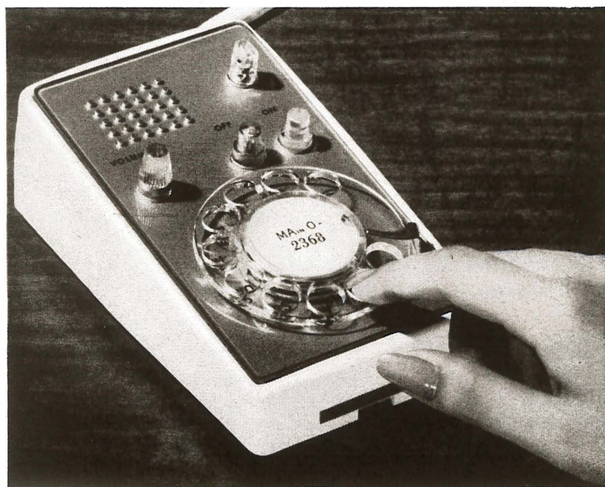
▼ A compact microphone-dial unit for "hands-free" telephoning.