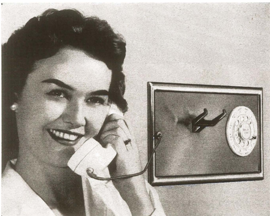
▲ A kitchen phone that can be recessed in a wall or cabinet.