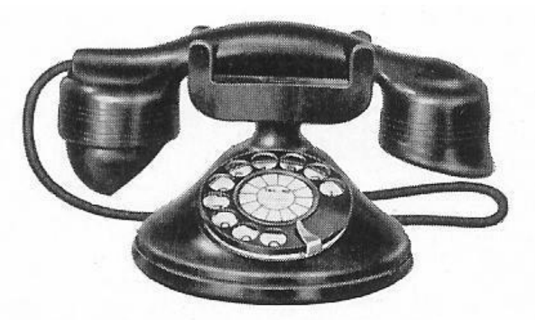
Automatic Monophone Desk Set No. 1-A