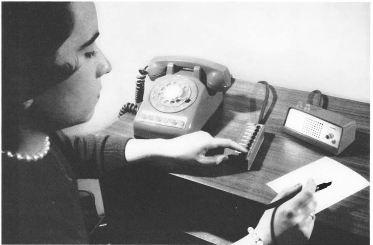
Fig. 1 — Speaker phone-equipped key telephone with six push-buttons and additional “pad” of keys.

station apparatus which the customer both sees and uses, improvements are generally made with a two-fold objective. To the Bell System, the redesign must mean more versatile and economical plant equipment; to the customer it must mean tangibly better service.