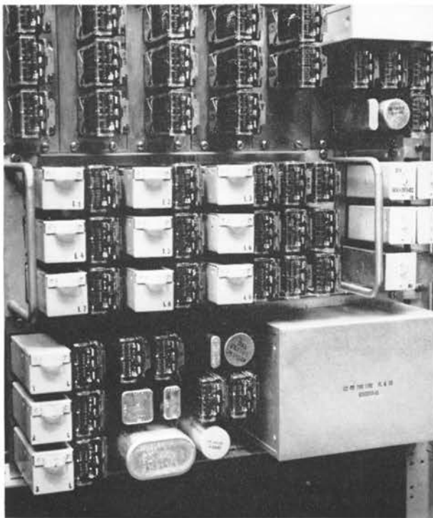
Fig. 3—Typical station-system installation for single talking link class of service with twelve stations and some associated 1A1 system equipment.

Any major addition to existing telephone service also affects closely associated systems. Station systems have had to operate on 14-to-26-volts dc supplied over feeders from a 24-volt battery in the central office. The scarcity of feeder cable pairs, however, has meant that in many cases it has been necessary to substitute local rectifiers such as the 101G power plant. The power arrangements usually used with older installations would be inade-