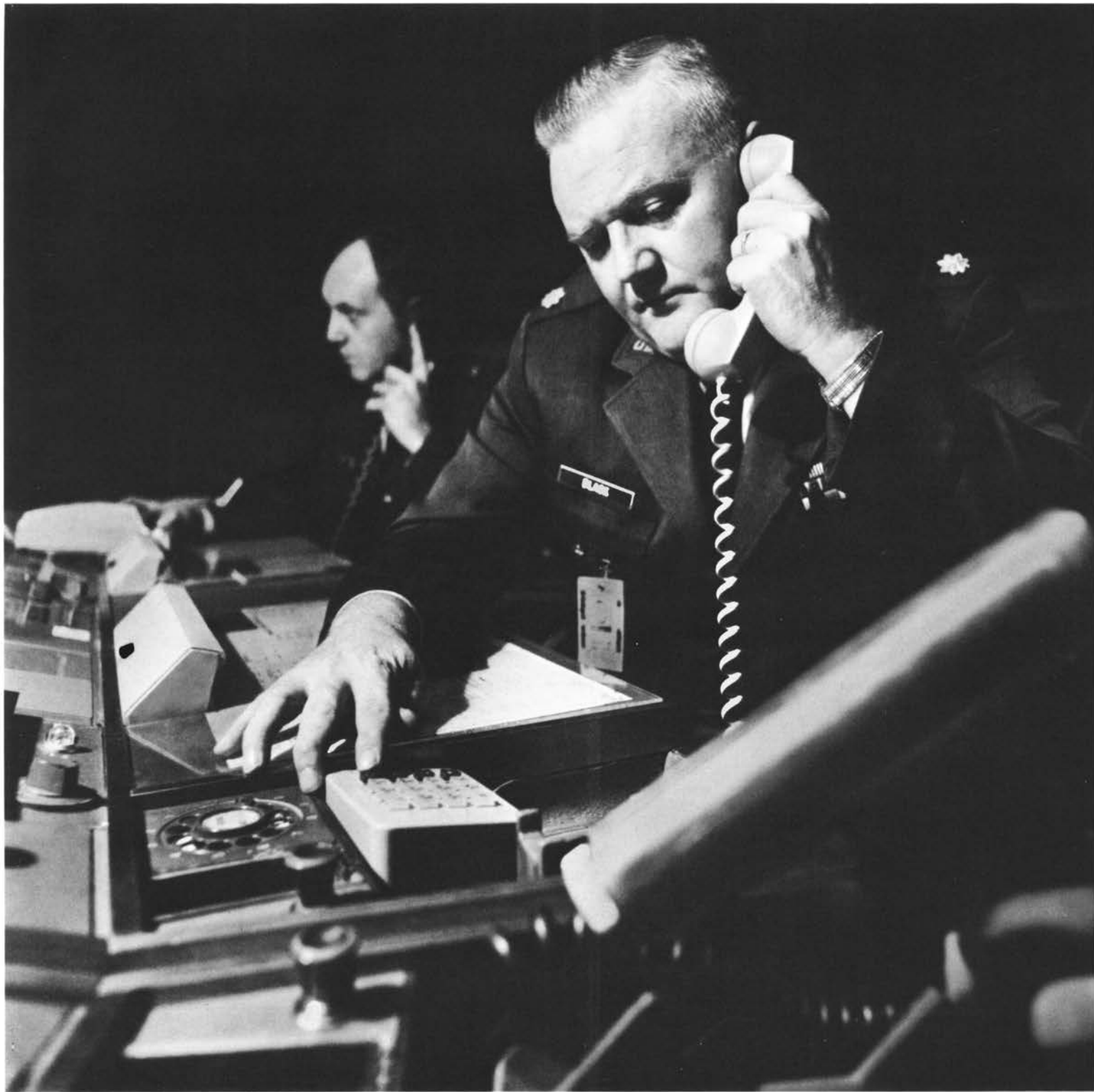
The AUTOVON network, when fully operational in 1970, will link military bases and command posts (like this one at Stewart Air Force Base, Newburgh, New York) throughout the world.