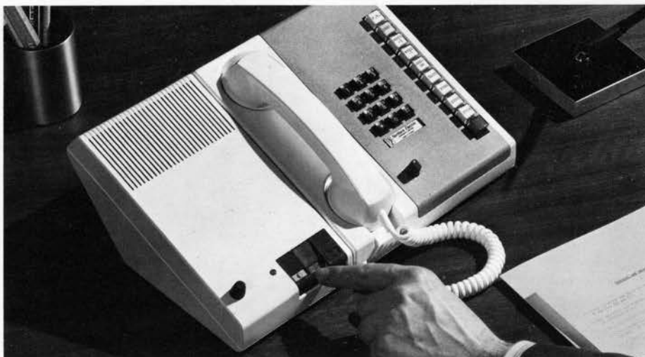
Desk-mounted LOGIC 10 and LOGIC handsfree units

A LOGIC handsfree unit can be installed simply by plugging it in to any LOGIC 10 key telephone set which has been field-activated to accept it. Field modification of LOGIC 10 key telephone sets to accept the LOGIC handsfree unit is simplicity itself. No special tools are required. A socket and cable assembly which is prewired inside the set simply replaces a filler plate in the side of the housing. One end of a power cord is connected inside the telephone set to quick-connect terminals and the other end is connected to an NE-2012B transformer which plugs into any 120 V ac power outlet. The handsfree unit is plugged into the LOGIC 10 key telephone set to complete the installation. The whole process can be completed in less than five minutes.