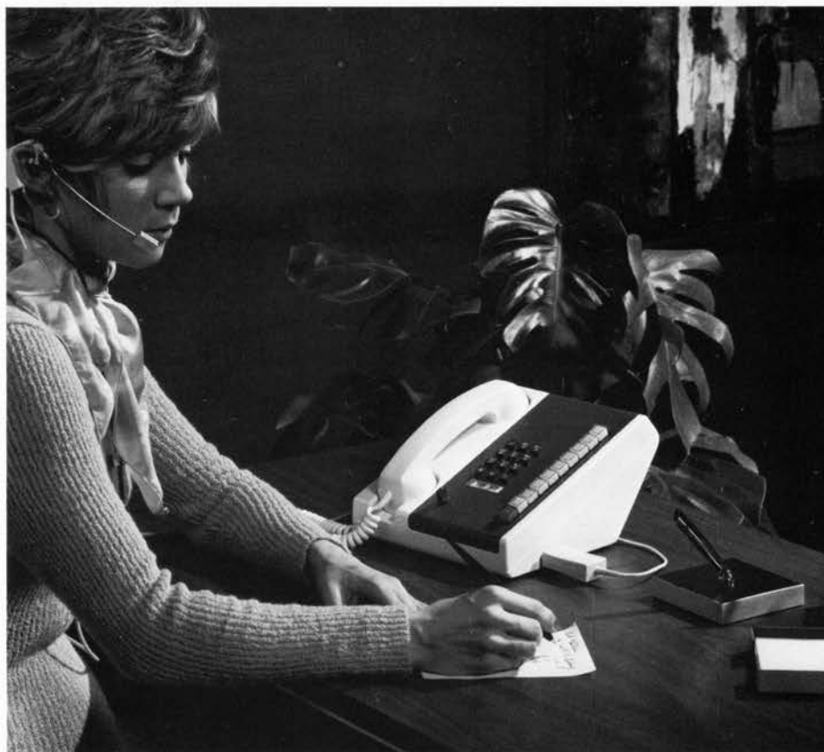
LOGIC 10 key telephone set equipped with headset option

With LOGIC 10 key telephone sets, your subscribers can receive, hold, transfer and originate calls on up to nine telephone lines. The lines can be all central office, all private branch exchange, or any combination desired, up to the maximum. Or if the maximum number of lines is not required, the extra keys can be used to control other service features such as add-on, or intercom, provided these services are available from the subscriber's key system. LOGIC 10 key telephone sets are handsomely styled — their contemporary design enhances even the most modern business environment. Their large, easy-to-use, self-designating keys are a pleasure to operate. The no-jam hookswitch and the third-party calling position further contribute to ease of operation. And the options let your subscribers select the features that best suit their requirements.