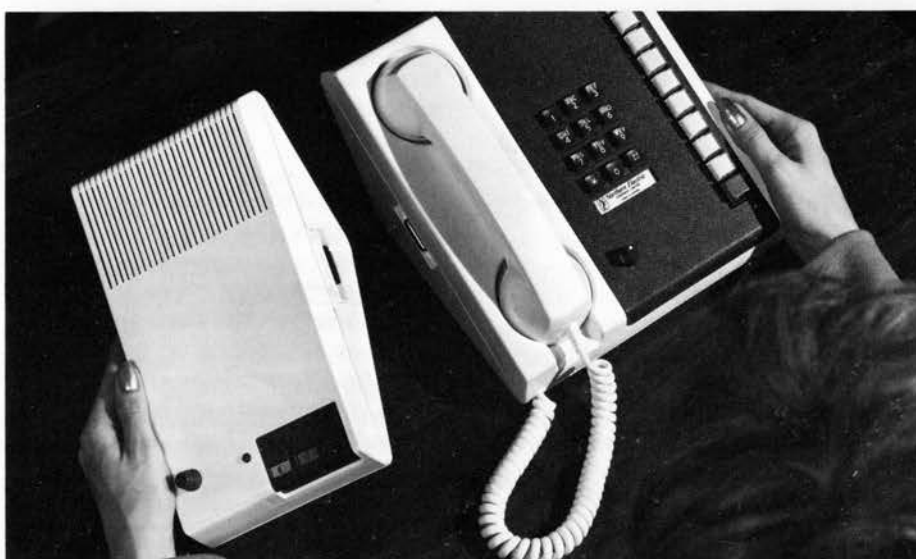
LOGIC handsfree unit is installed simply by plugging it into a field-activated socket