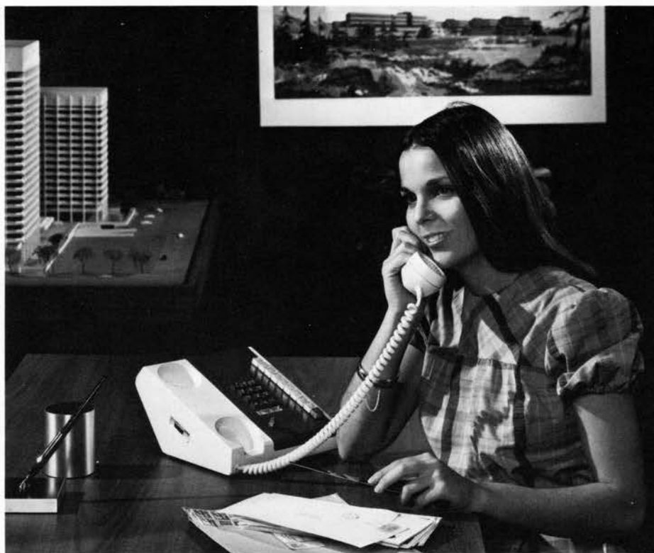
Standard LOGIC 10 key telephone set

LOGIC 10 key telephone sets are designed to interface with 1A1, 1A2 and 6A key telephone systems. They are compatible with a wide range of special application equipment including autodialers, automatic answering devices, impaired hearing and noisy location handsets, card dialers, voice and data couplers, etc.