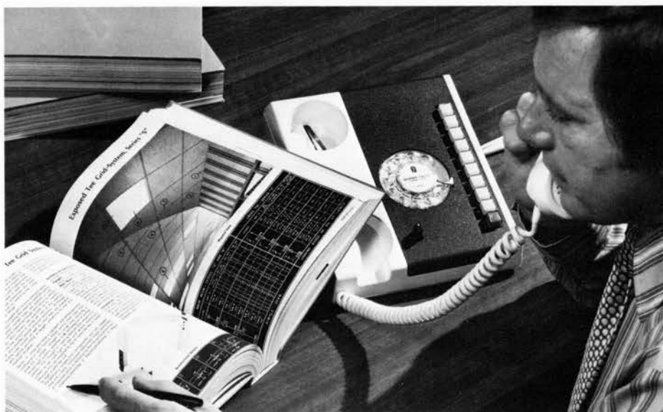
The hookswitch can't be accidentally jammed open

With the faceplate and housing removed, the rotary dial is taken out simply by lifting the dial while squeezing two tabs in the base of the phone. Two brackets on the rotary dial are then installed in reverse on the pushbutton dial and the pushbutton dial is snapped into place between the tabs in the base. All dial connections are spade-tipped for rapid connection to and disconnection from quick-connect terminals. The rotary dial faceplate is replaced with a pushbutton dial faceplate and conversion is complete. The conversion can be easily completed in less than five minutes.