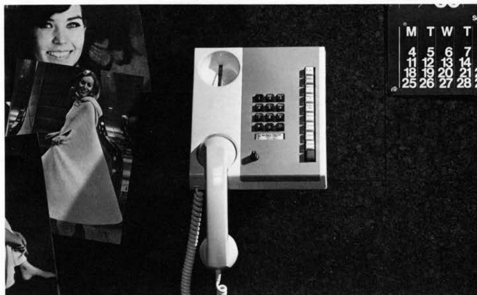
Third-party calling position