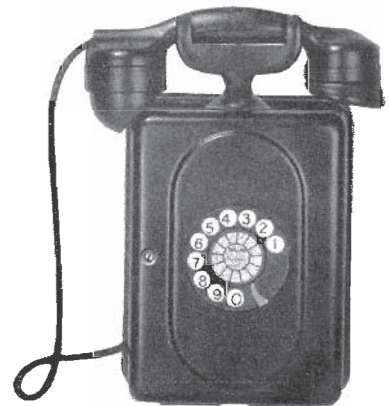
Dial Monophone Wall Set Types 3 and 13

Type 3 has a three-winding induction coil included in the wall box. Type 13 is equipped with an induction coil receiver, so requires no separate induction coil, but needs the resistance coil as listed. Metallic ringing circuits require one condenser; ground ringing circuits, two.