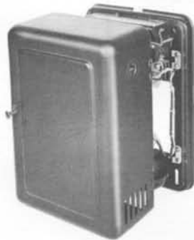
Fig. 1—534-type Subset Showing Hinges Reversed