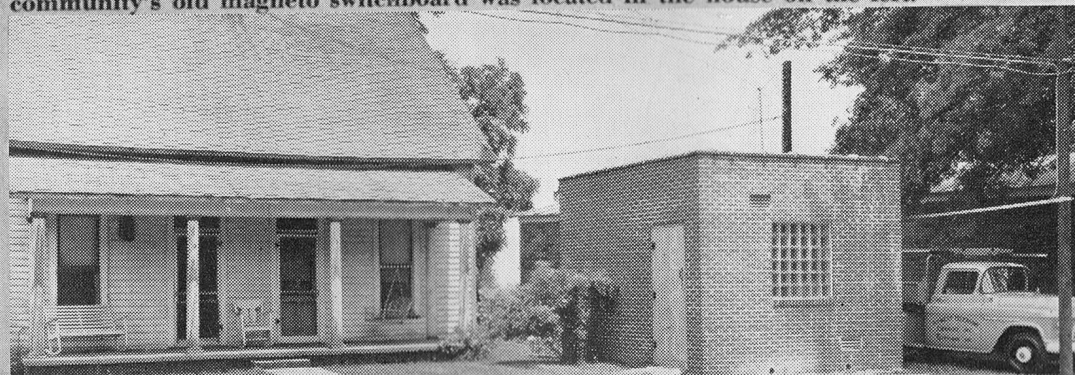
(Below) This new exchange building houses the Leich dial installation in Otwell. The community's old magneto switchboard was located in the house on the left.

With the conversion of Otwell, 11 of the Midwest Telephone Company's 12 Indiana exchanges have Leich Dial Systems.