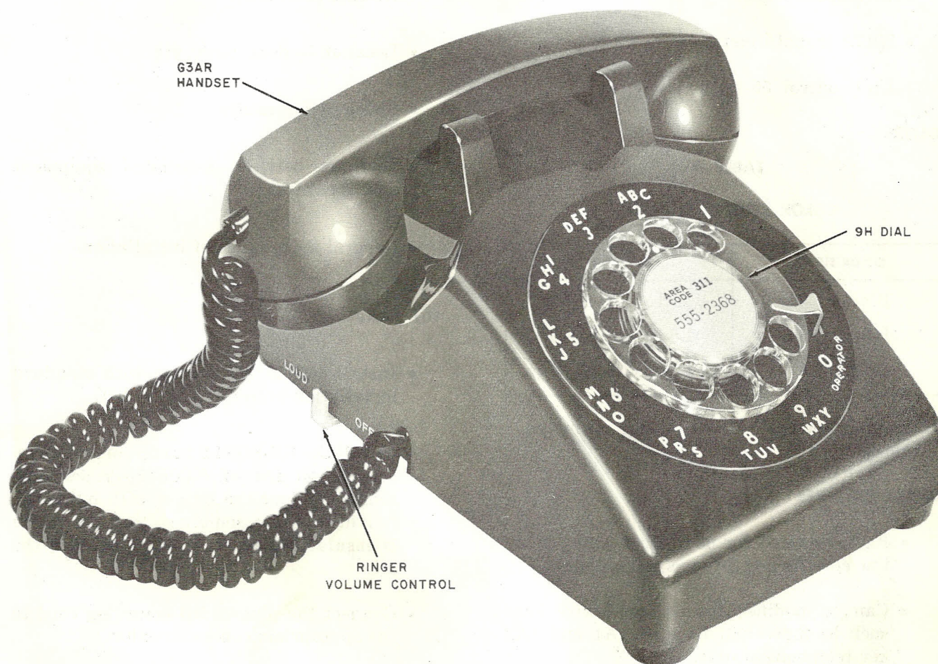
Fig. 1 — 500AD Telephone Set