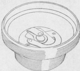
Transmitter Case (P-247608)