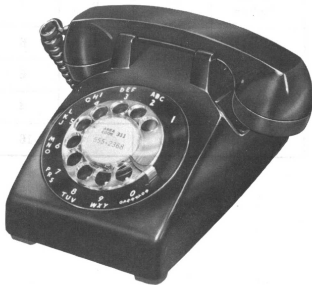
Fig. 1—529B Telephone Set

1.03 This telephone set is recommended for use in place of the 329C set.