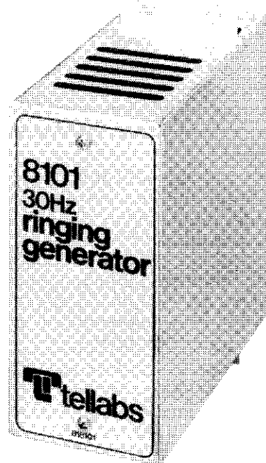
figure 1. 8101 Ringing Generator

2.03 The 8101 will provide up to 5 watts of ringing energy, which will operate 5 standard telephone